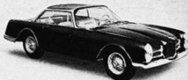
FACEL VEGA $12,990