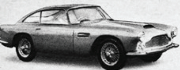
ASTON MARTIN $12,500